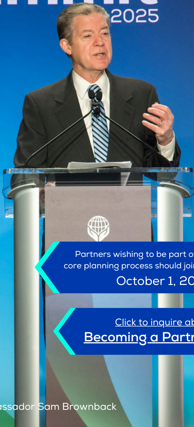
Ambassador Sam Brownback

Partners wishing to be part of the core planning process should join by October 1, 2025