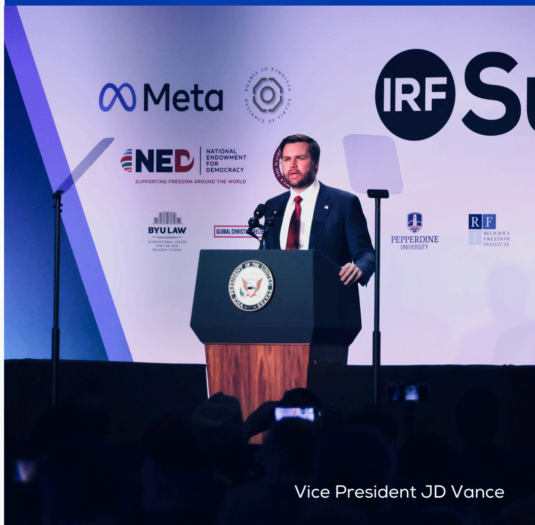
Vice President JD Vance